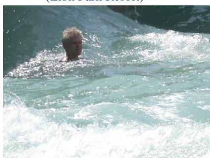
Figure 5 WATCHOUT PASTOR! (Yours truly)