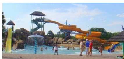
Figure 2 The Waves (Lion Park Resort)